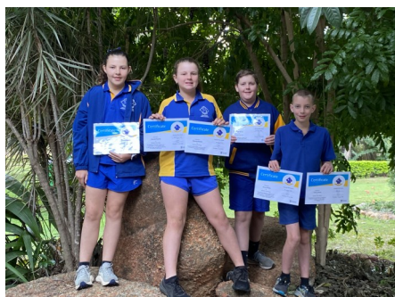
Week 2 Parade